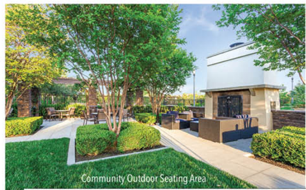
Community Outdoor Seating Area