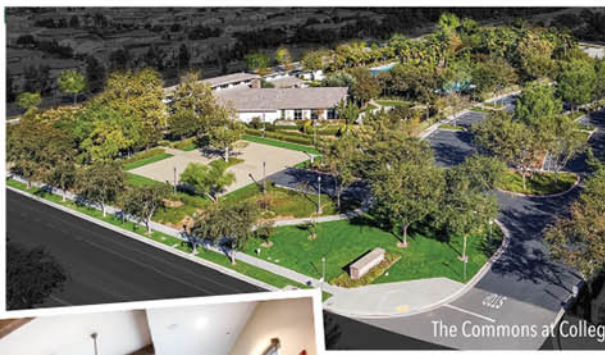
The Commons at College Park